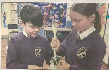
Children at the school and, below, some of the plastic collected.