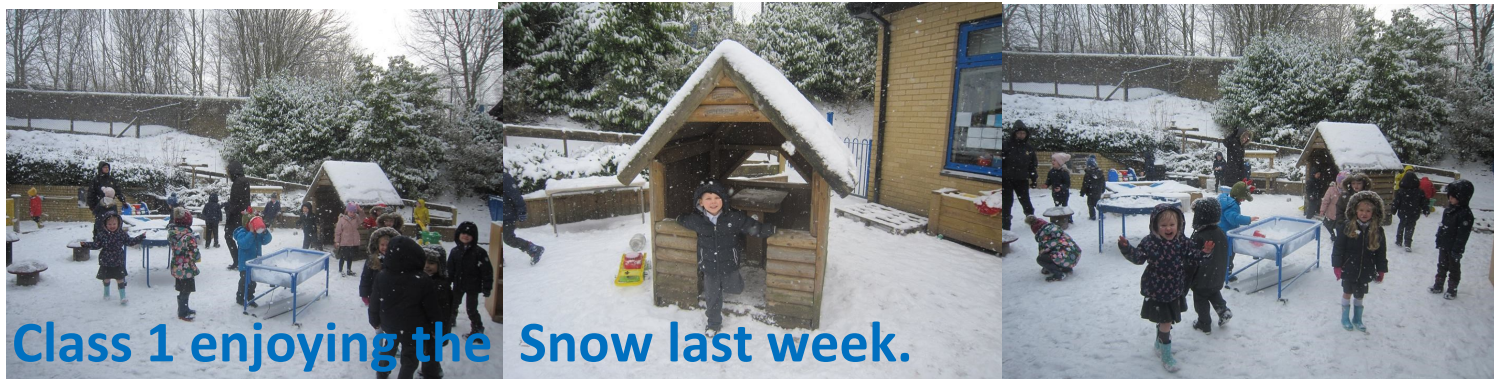
Class 1 enjoying the Snow last week.

Congratulations to our two homework competition winners whose names were drawn out of a hat over the weekend. They will be choosing a book from the amazon website as their prize! Well done to both of you and thank you to everybody who entered!